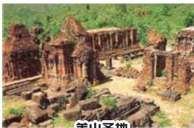
美山圣地 Miyama Holy Land

早餐后，可以前往岘港 哥德式教堂 ，教堂建于1923年法国统治时期的天主教堂，然后前往参观 岘港皇冠酒店的娱乐赌场 ，试试运气。参观毕后，送往机场，返回美丽家园“吉隆坡”。